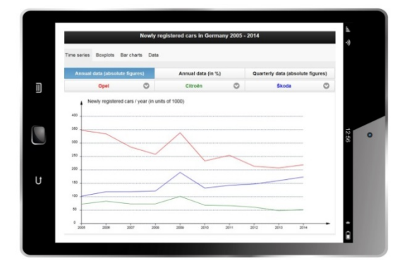
Figure 3: Interactive exploration of official data for Germany on newly registered cars

for the period 2005 - 2014, with breakdown by brands. Instead of simultaneously displaying time series graphs for all brands, only three user-selected three graphs are visualized. The left-hand side of Figure 3 refers to quarterly data whereas the right-hand part presents annual data referring to the brands Opel, Citroen and Skoda.