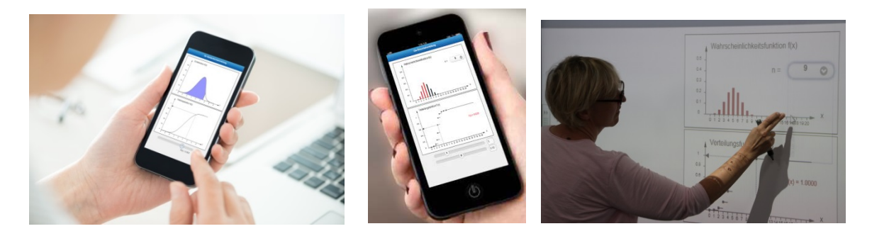
Figure 1: Learning objects displaying the standard normal and the binomial distribution

The minimization of text on screen and the design of the objects as self-contained mini-learning worlds facilitate their translation into other languages. Figure 2 shows again the learning objects presented above, but now in English and Japanese (standard normal distribution) respectively in English and Korean (binomial distribution).